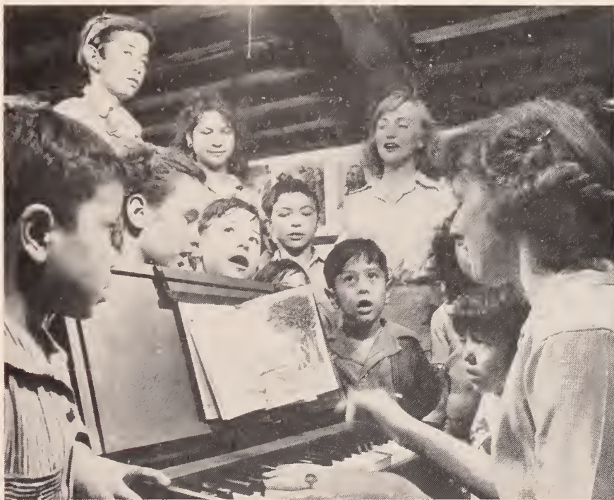
THESE BOYS AND GIRLS are the children of Spanish-speaking migrants whose parents at the time this picture was taken were working in the Minnesota sugar beet fields